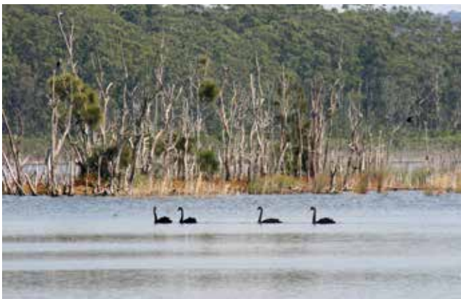
Meroo Lake swans

Cross the lake entrance (or detour over the road bridge if necessary), round Dolphin Point and Lagoon Head and traverse the walk's longest beach – Wairo – to reach Tabourie Lake Inlet, which can usually be crossed safely. Just off Tabourie Point, Crampton Island can also be circumnavigated at low tide.