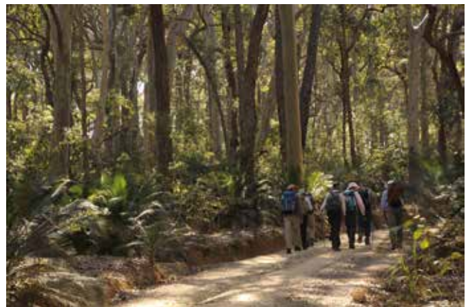
Spotted gum forest

More beach and headland walking brings you to Merry Beach with beach front camping sites in the caravan park. From here, a headland walk takes you over Snapper Point to Pretty Beach but it's far more interesting to rock-hop Snapper Point's rock platform, another geologist's delight. Pretty Beach, with its NPWS camping area, is the northern gateway to Murramarang National Park.